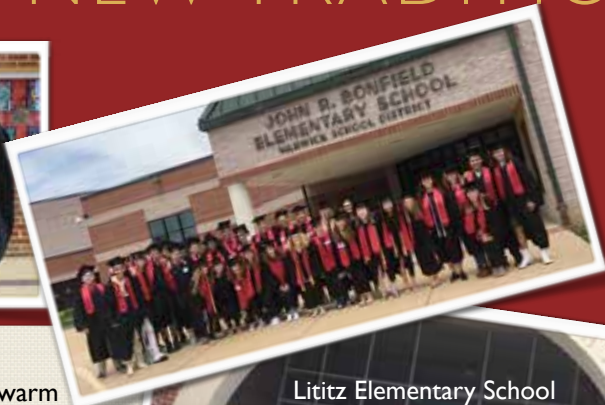
Lititz Elementary School